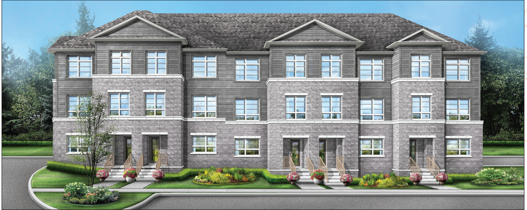
CORAL 30 ELEV. 2 • Part 16 1,861 Sq.Ft.