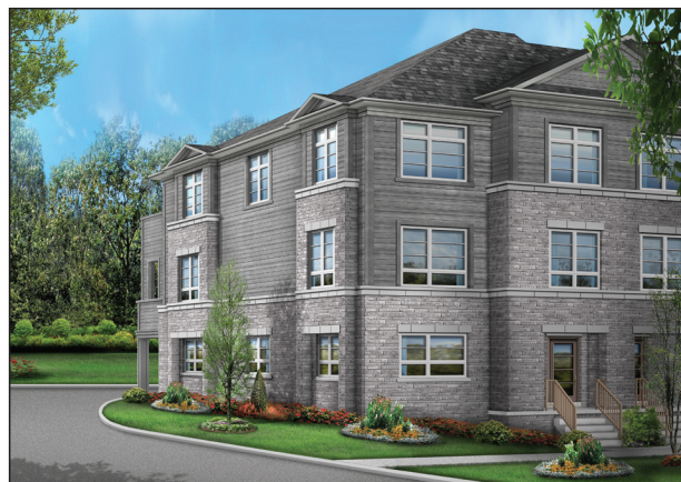
CORAL 30 • ELEV. 2 • Part 16 END ELEVATION