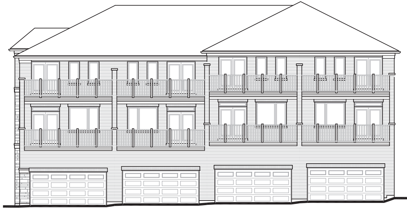
PEARL 20 ELEV. 1 • Part 20 2,277 Sq.Ft.