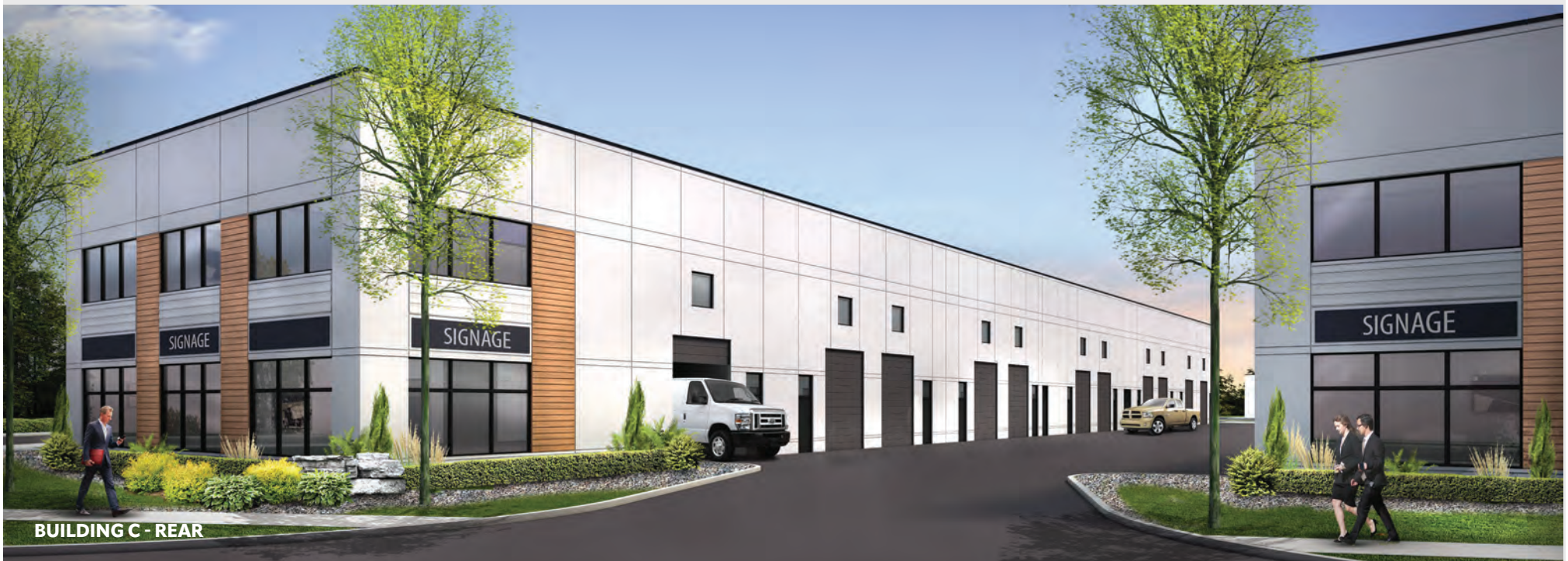
BUILDING C - REAR