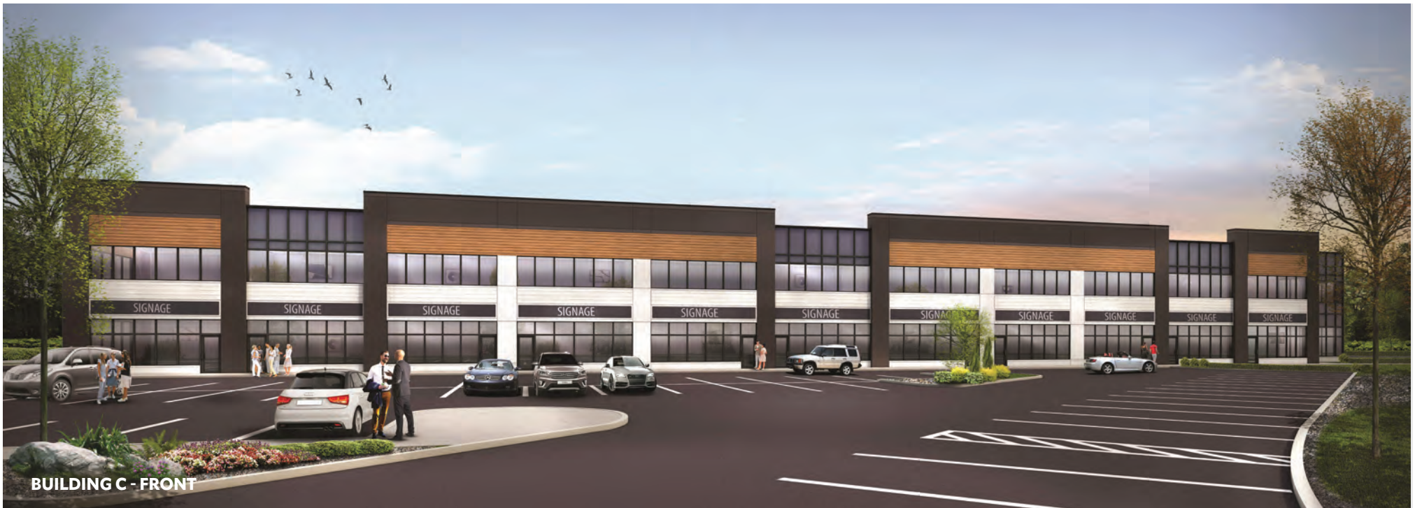
BUILDING C - FRONT